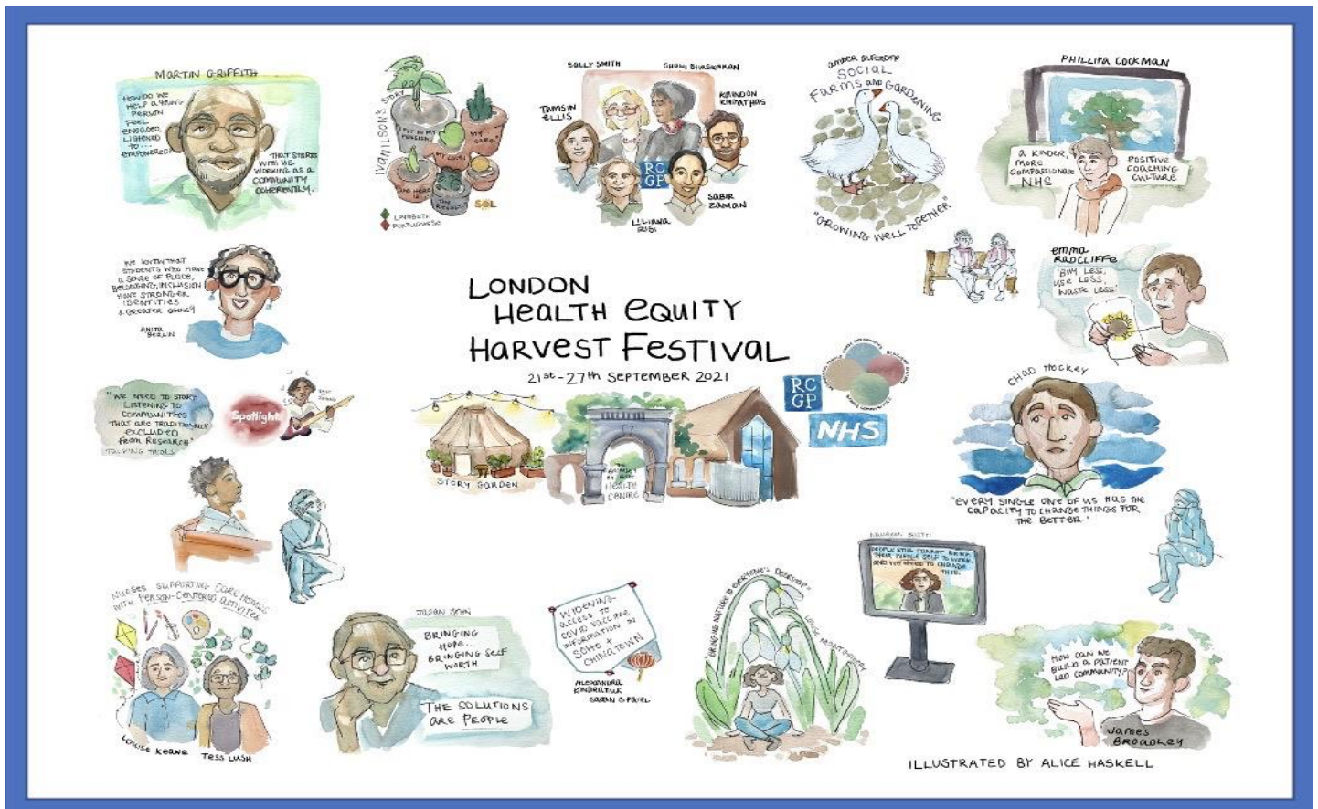
Figure1: Key messages of change captured by animation artist Alice Haskell